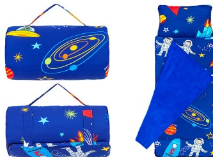
Nap Roll with handle